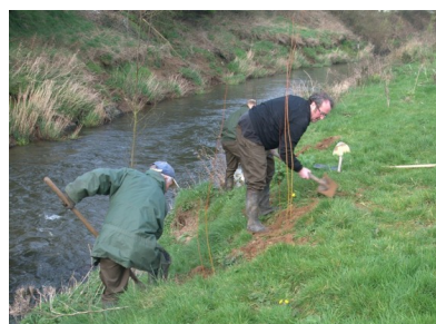
Tree planting along a river bank.

https://drive.google.com/open?id=1LAe35U3U3WieAJFI-TPPIv8K_IFbteH2&usp=sharing